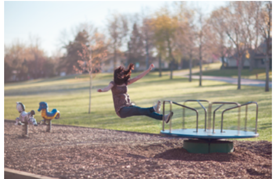
Kyla Medina - That Feeling of Falling, 76x51cm, unframed, £1220