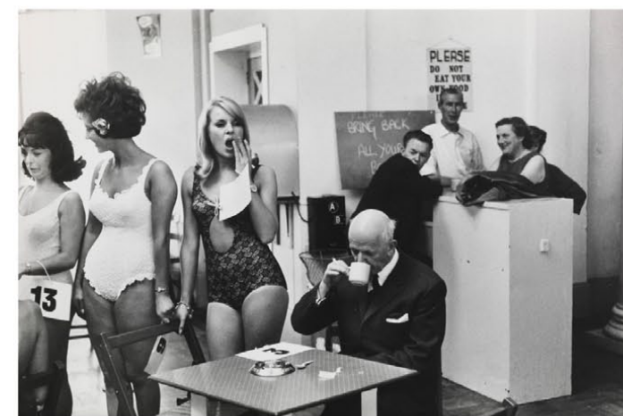
Beauty contestants, Southport, Merseyside, 1967 by Tony Ray-Jones © National Media Museum

Last, but by no means least at the new Media Space Gallery at the Science Museum, Only in England: Photographs by Tony Ray-Jones and Martin Parr. The exhibition shows work by two photographers fascinated by the eccentricities of English social customs. Parr is also exhibiting his own rarely seen 1960s and '70s series, 'The Non-Conformists'.