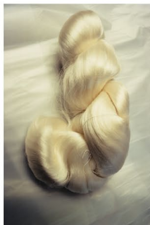
Miyako Ishiuchi: Silken Dreams #72, Raw Silk, Annaka 2011

There are currently a huge number of outstanding photography exhibitions on in London. The highly regarded Japanese photographer Miyako Ishiuchi is having a major exhibition at the Michael Hoppen Gallery. The exhibition includes work from all her major series and her latest body of work Silken Dreams.