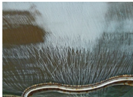
Bench - Jo Crowther

accompanying British forces during the invasion that became the Second Anglo-Afghan War from 1878-1880. Norfolk's photographic project in Afghanistan takes its cue from Burke's work. Taken in 2010, his images re-imagine or respond to Burke's Afghan war scenes in context of the contemporary conflict. The twin exhibitions are being held at Level 2 Gallery, Tate Modern, London SE1 until 11th July and at Michael Hoppen Contemporary, 3 Jubilee Place, London, SW3 until 18th June.