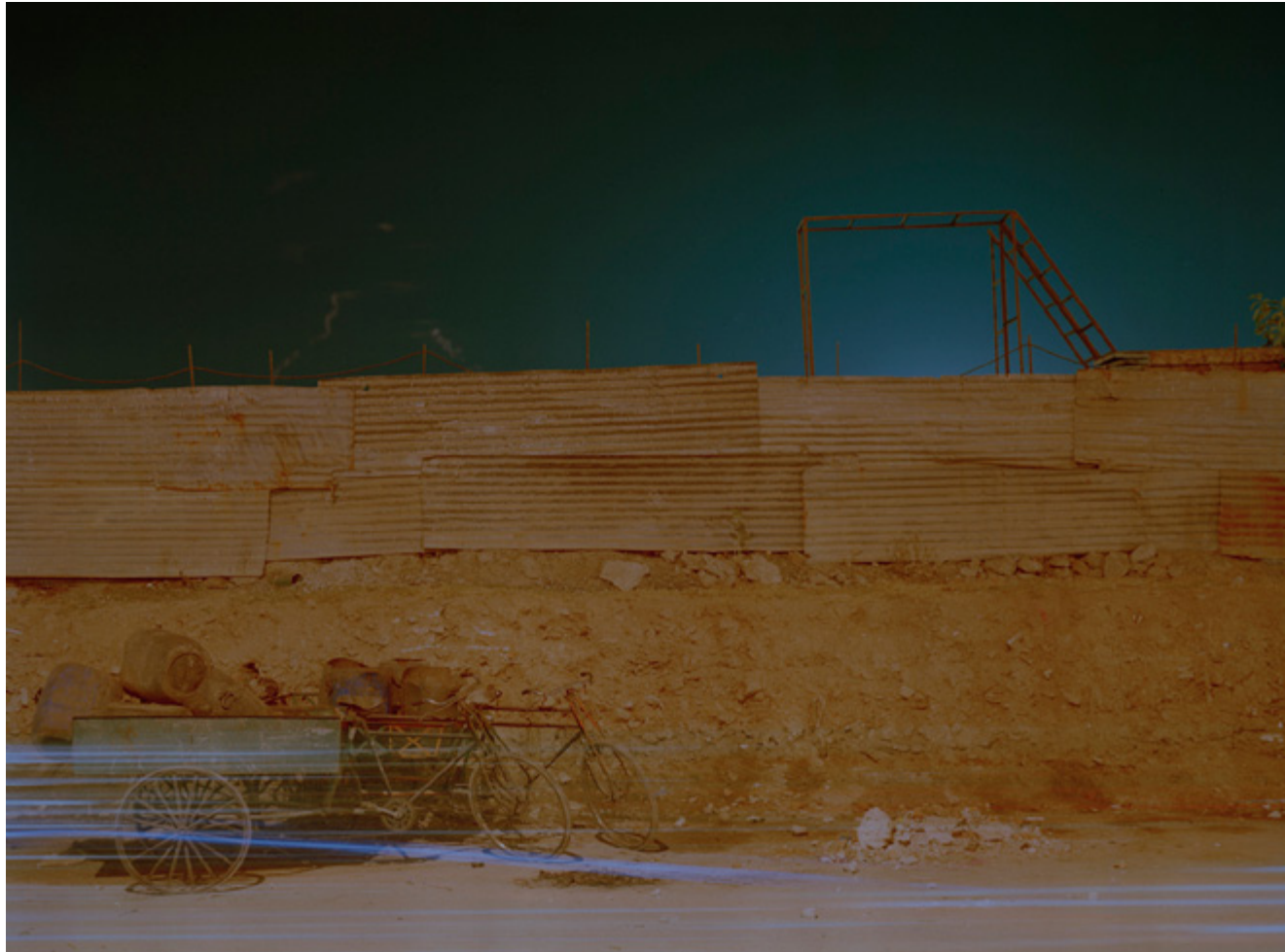
Kaldiwala-3, Ahmedabad, 2010 - Shiho Kito

pikari is an onomatopoeia in Japanese, which means 'shining' or 'flashing'. The idea for pikari came from 'star-navigation', the ancient technique of Polynesian sailors who would find their location and direction guided only by the natural environment. Since leaving Japan, Shiho has used lights in cities all over the world to find her path. The photographs have been created using a large-format camera with 20-80 minute exposure time. Shiho won the Prime Minister's Initiative Fund from the British Council and has worked for this project mainly in Ahmedabad, India since 2008. To see more of Shiho's work, visit www.cranekalmanbrighton.com/photographers/shihokito