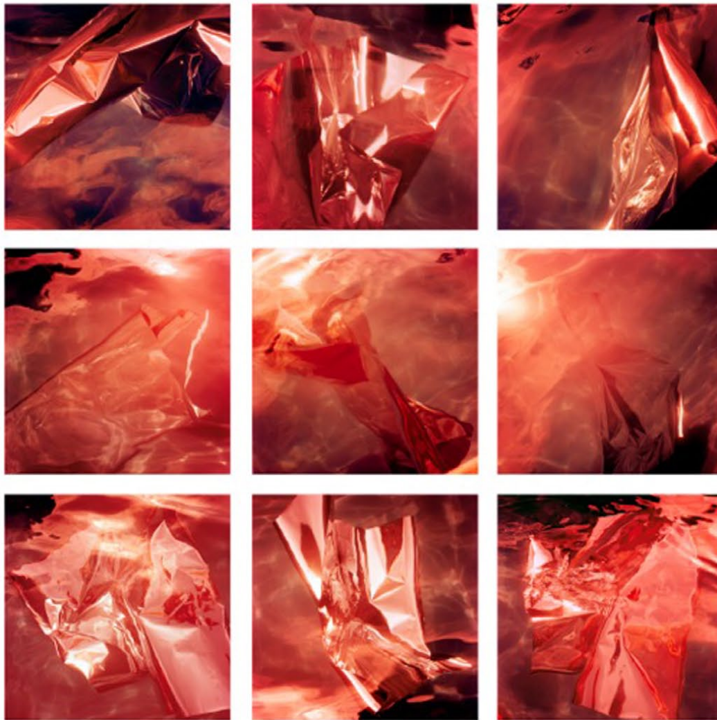
Untitled (Collisions Grid), 2012 – Karine Laval

NY based, French photographer Karine Laval, has just launched a new body of work entitled Altered States , which pushes still further her development into a more abstract, conceptual style of work. The title of the series references different states of transformation, such as physical transformation and distortion; and altered states of consciousness and perception, but it also reveals the transformative power of the camera.