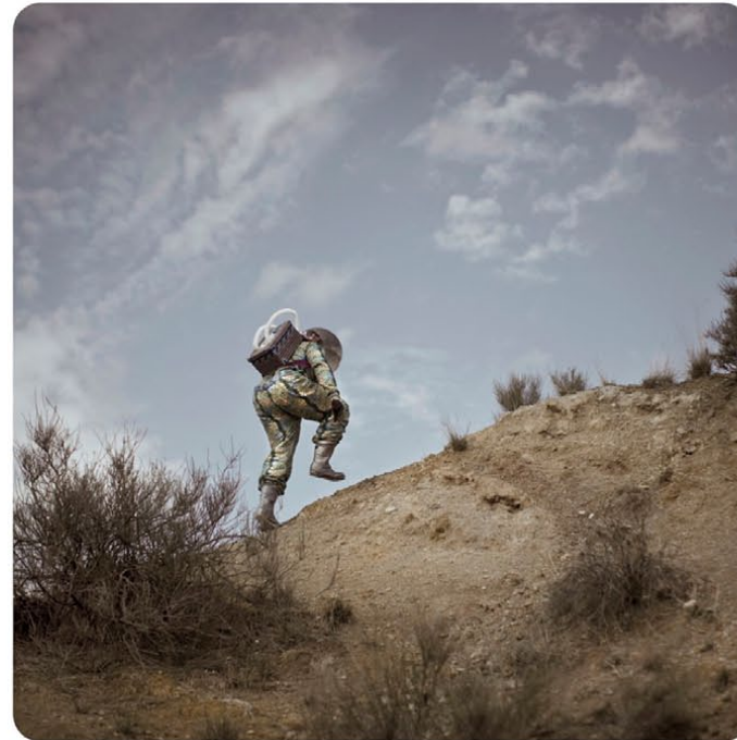
Cristina De Middel, Untitled, from the series The Afronauts, 2011, © Cristina De Middel Courtesy of the artist

Deutsche Borse Photography Prize 2013 , The Photographer's Gallery, 16-18 Ramillies Street, London W1 until 30th June 2013.