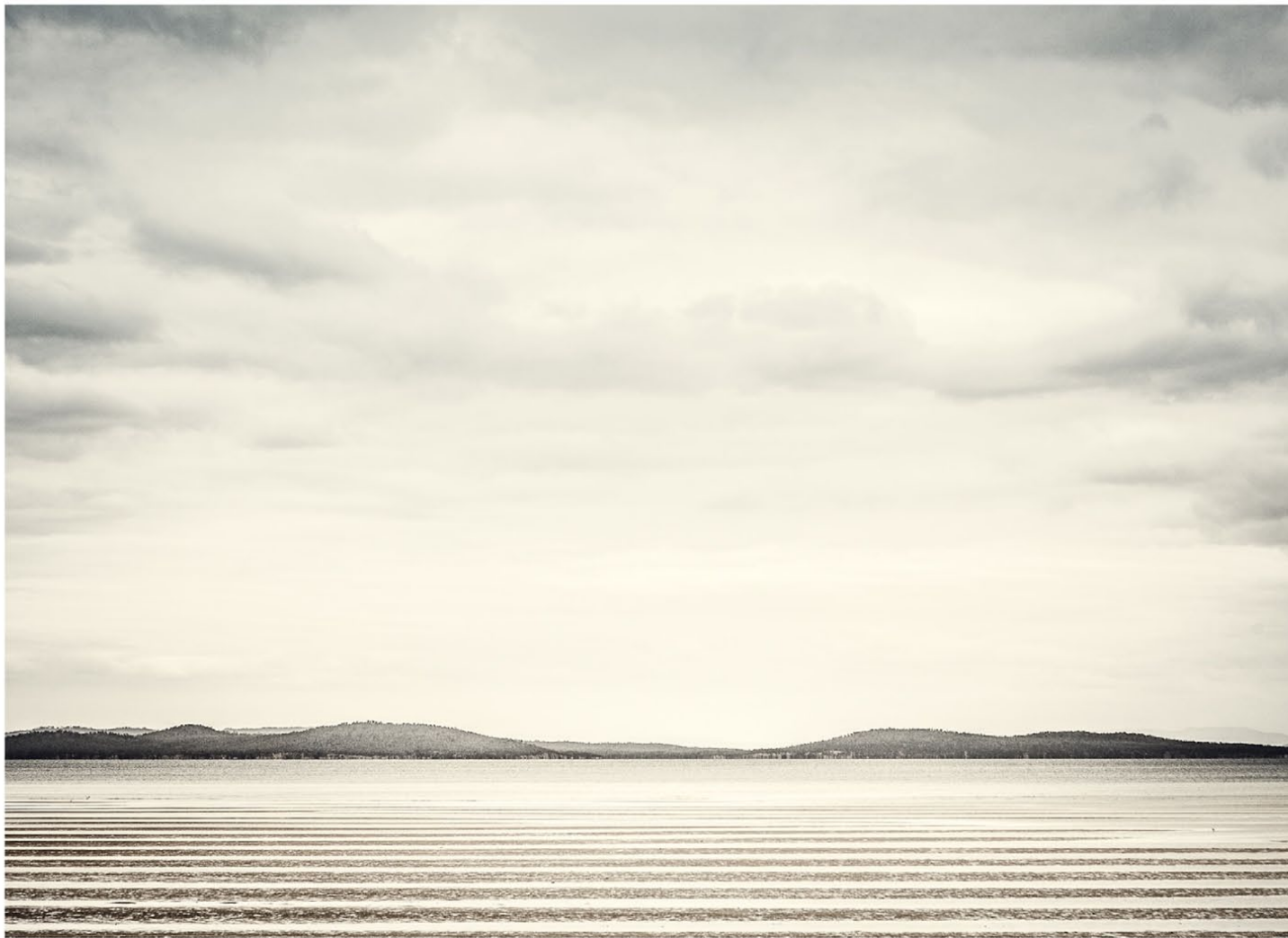
Ridged Sands, 2012 – Morgan Silk

From exposed tidal beaches which created strange uniform ridges in the sands that went on for miles, to the almost prehistoric nature of some of the unique island vegetation, and the extraordinary unspoilt beauty of the Bay of Fires, regarded as one of the most beautiful beaches in the world, Tasmania made an indelible impression on the photographer.