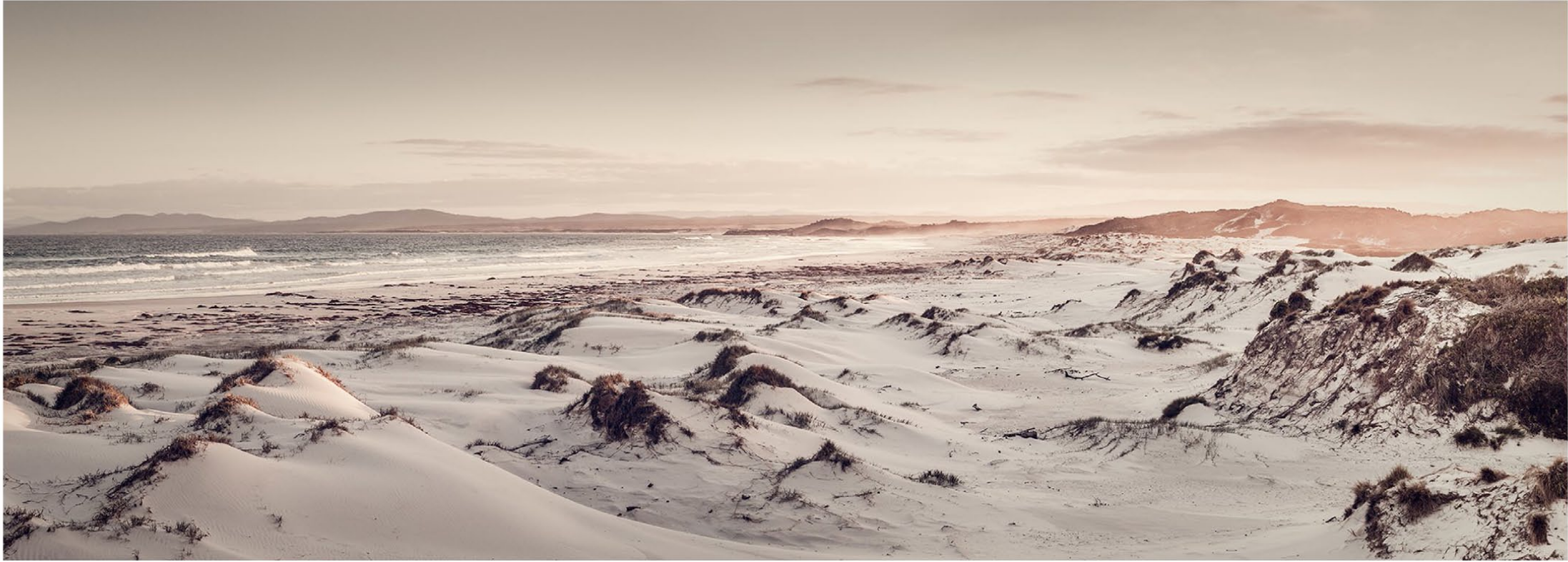
Bay of Fires, 2012 – Morgan Silk

A winner in the Association of Photographers 2012 Annual Awards, Morgan Silk's latest body of work Tasmania, was inspired by the extraordinary natural beauty and wild landscapes of the Antipodean island. Whilst on an assignment for One Life Magazine, to track the story of sightings of the Tasmanian Tiger, widely believed to be extinct since the 1960s, Silk was captivated by the unusual and majestic landscapes around him.