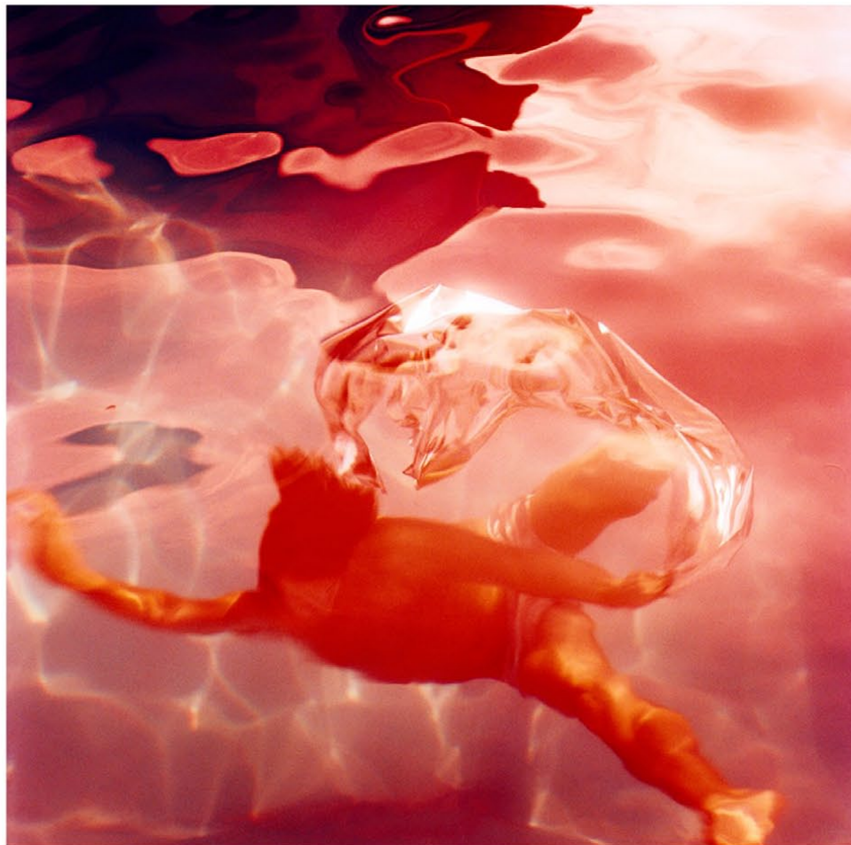
Untitled #1 (Flux), 2012 – Karine Laval

Karine Laval was born in Paris, and has been living and working in New York since 1997. Her works have been widely exhibited in solo and group exhibitions in the United States and internationally at such venues as the Palm Springs Art Museum, the Los Angeles Center for Digital Art (USA), the Sorlandet Art Museum in Kristiansand (Norway), the Palais de Tokyo in Paris (France), and at several photo festivals throughout Europe and the US. Her video "Inferno" was presented at Centre Pompidou in Paris as part of the official selection of the ASVOFF International Film Festival in 2011. Laval was a finalist of France's Villa Medicis Hors Les Murs and she is the recipient of the Peter S. Reed Foundation Grant. To see more of Karine's work, visit www.cranekalmanbrighton.com/photographers/karine-laval