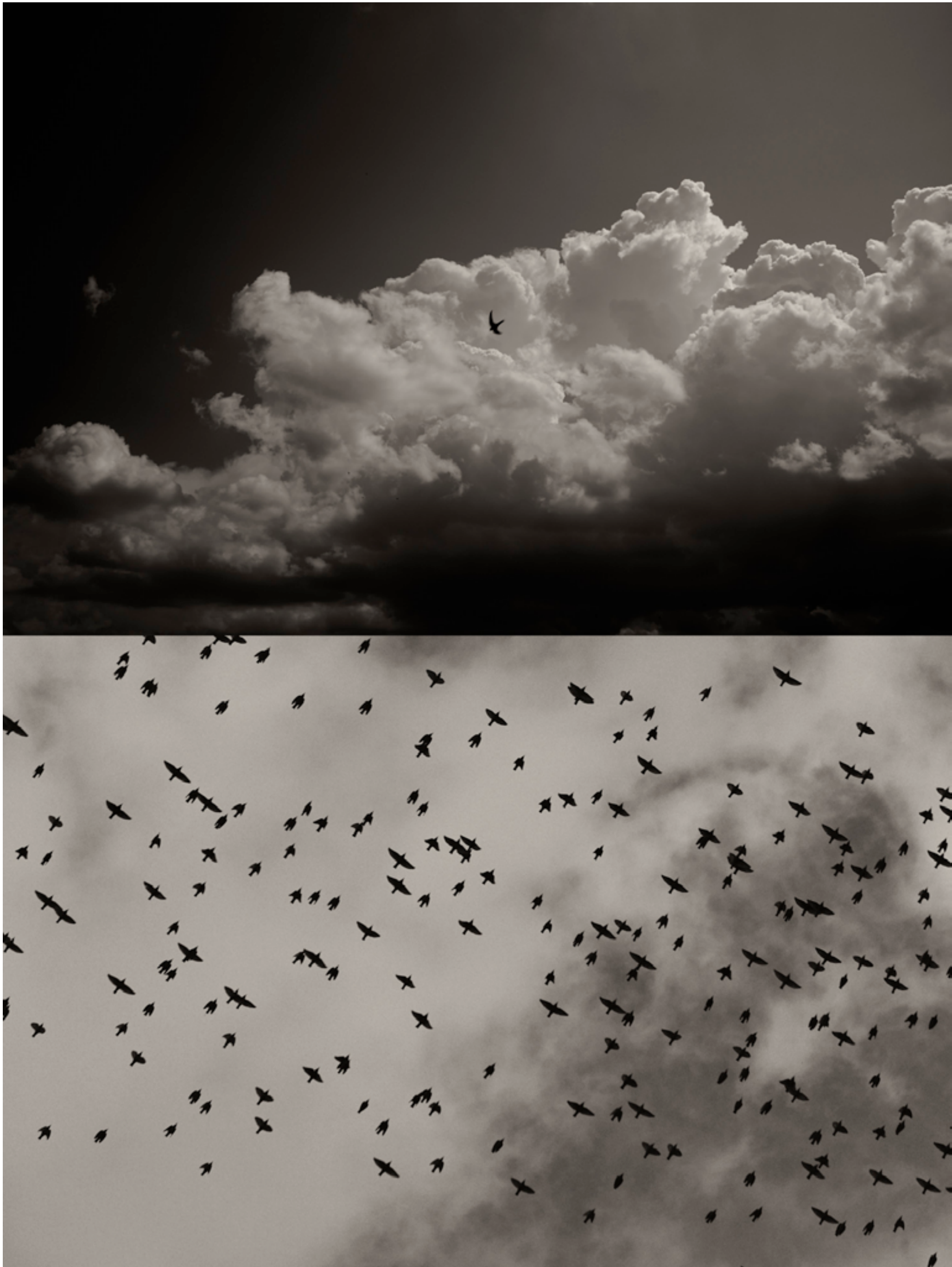
Gaia 59 , 2023