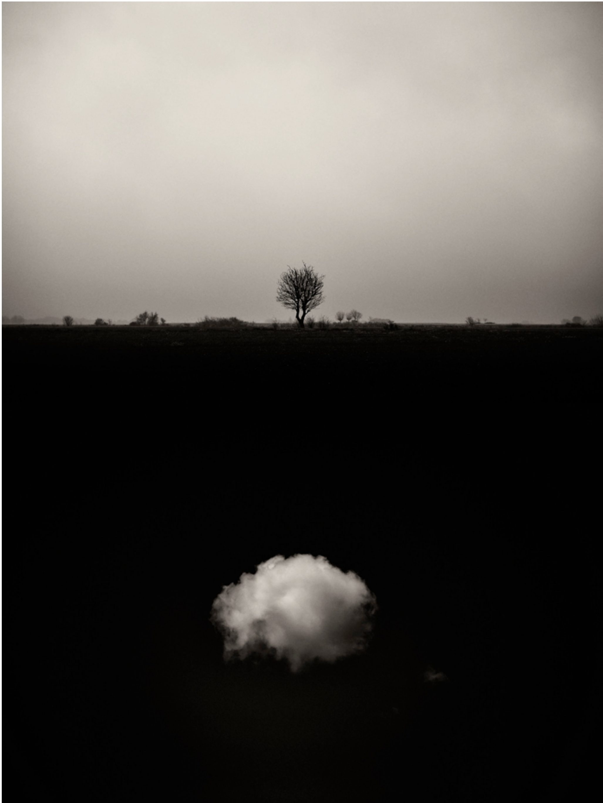
Gaia 6 , 2023