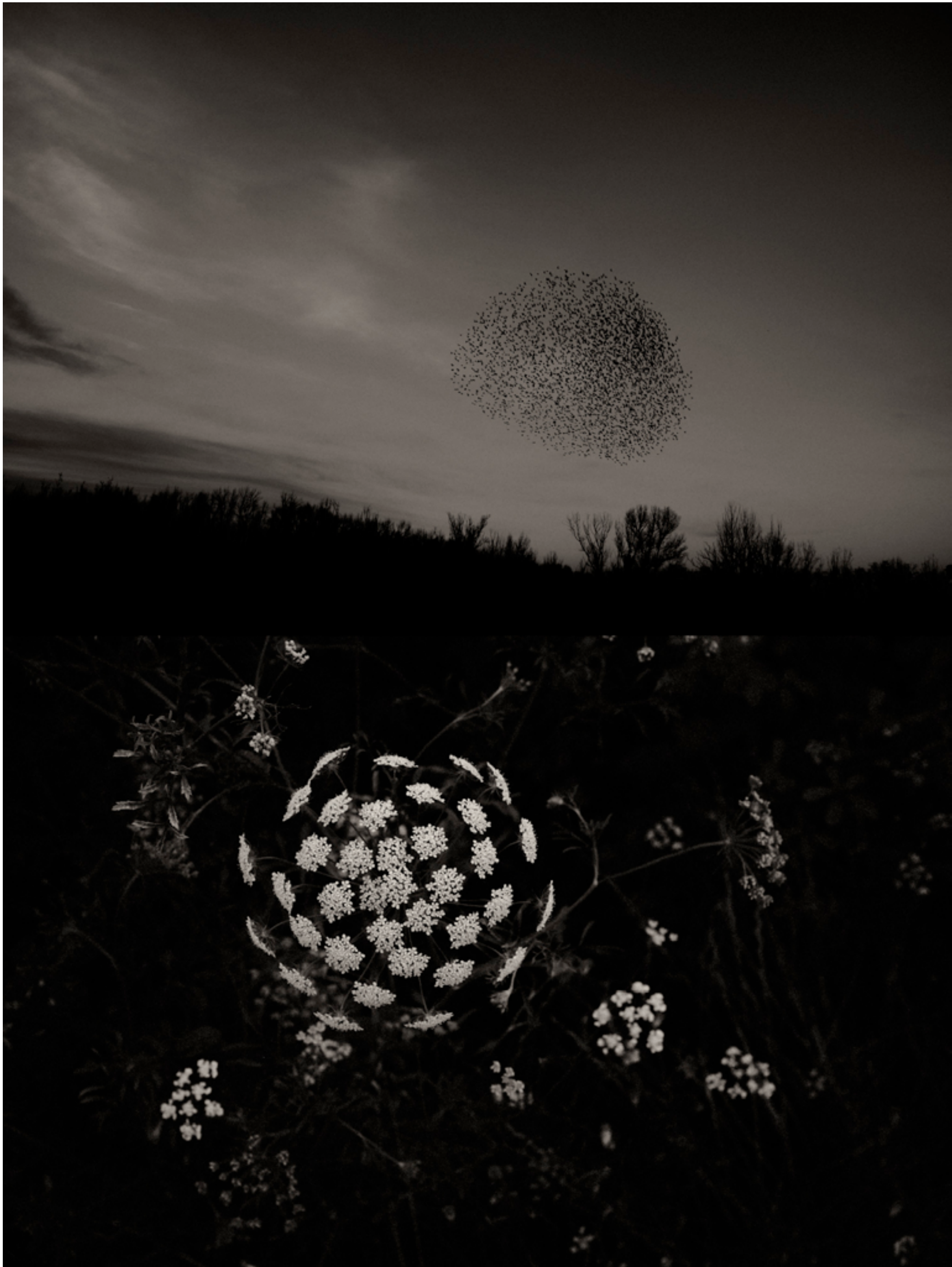
Gaia 68a , 2023