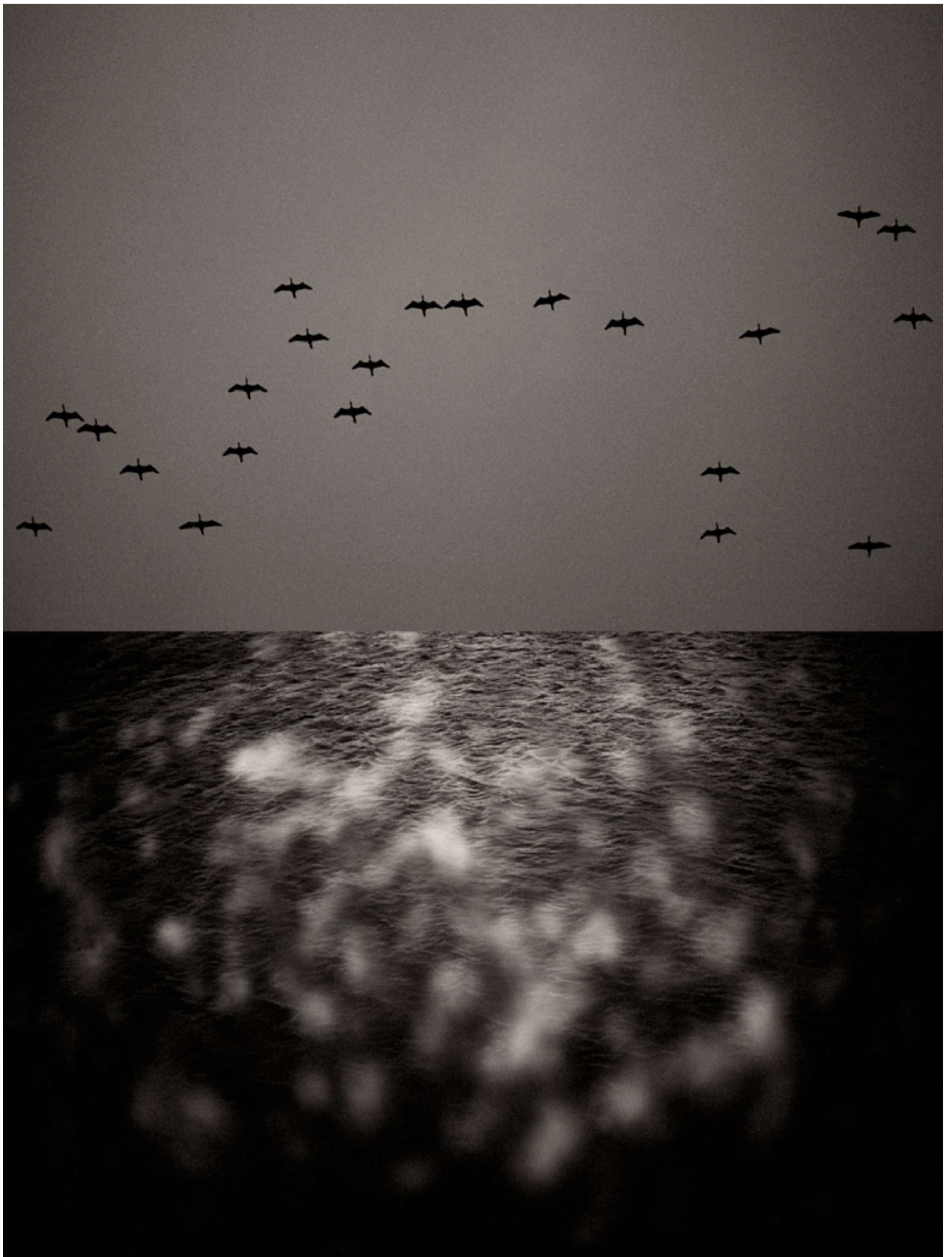
Gaia 114 , 2024