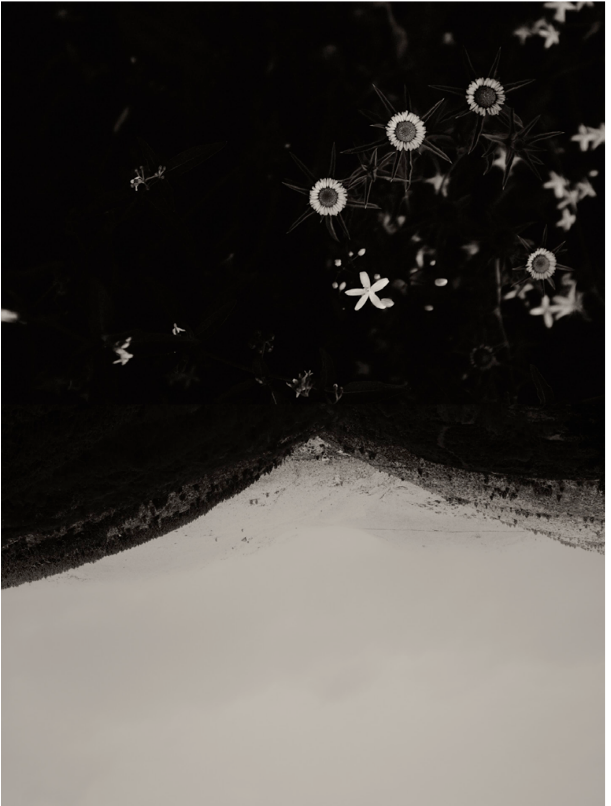
Gaia 128b , 2024