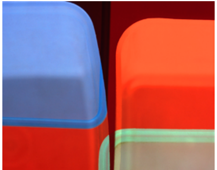
1. Untitled #173, 2000 © Richard Caldicott, courtesy of Atlas Gallery

ATLAS Gallery presents Table of Contents a solo exhibition surveying 25 years of photographic innovation by Richard Caldicott. Renowned for his meticulous attention to detail, inventive compositions and striking use of colour and form, Caldicott invites viewers to re-examine the everyday through his lens, transforming the mundane into the extraordinary in an attempt to transcend the limitations of photo-based art. The exhibition is on at the ATLAS Gallery, Dorset Street, London W1 until 26th April 2025.